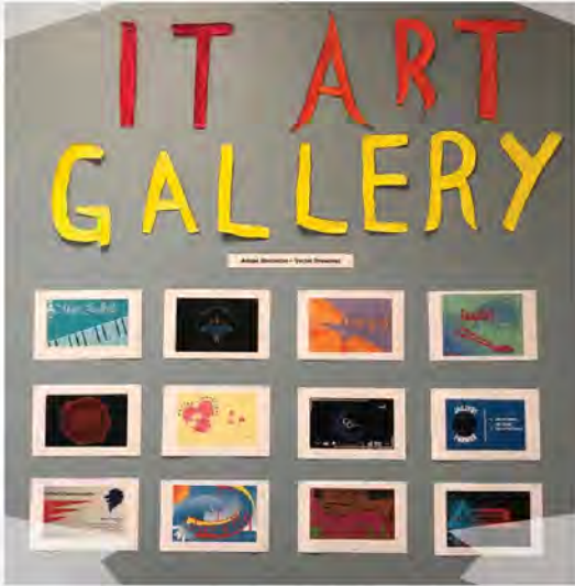
Figure 11a "I.T. ART GALLERY" posted in the Media Minds classroom, with sample illustrations made using Adobe Illustrator.