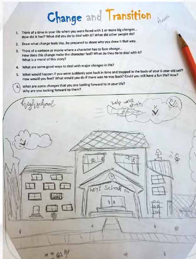
Figure 2. Cutting, pasting, idea-generating.