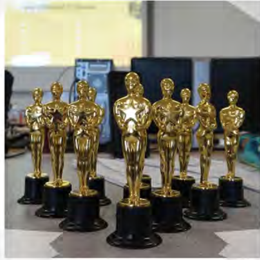
Figure 11b. "Academy Awards" a playful touch to match the theme of filmmaking.

Considering these three definitions of "learning environment" allows a dynamic and relational view to be achieved about how people, space, and objects interact in the process of informal learning. In all three definitions offered, the material and social surroundings matter in their experience of learning (Hopwood and Paulson 2012; Bresler 2013). Theorizing from the intersection of design and education, Bennett (2005, 2006, 2011) has identified properties of successful learning spaces: that they support a distinction between socializing and studying; provide choices and flexible uses for students; allow for territorial claims (i.e. a chair and a desk per student); need some seclusion and control distraction; require a range of activities to reflect engagement; and foster a sense of community. The learning environment of the Media Minds program is effective in that it contains the features of successful informal learning spaces.